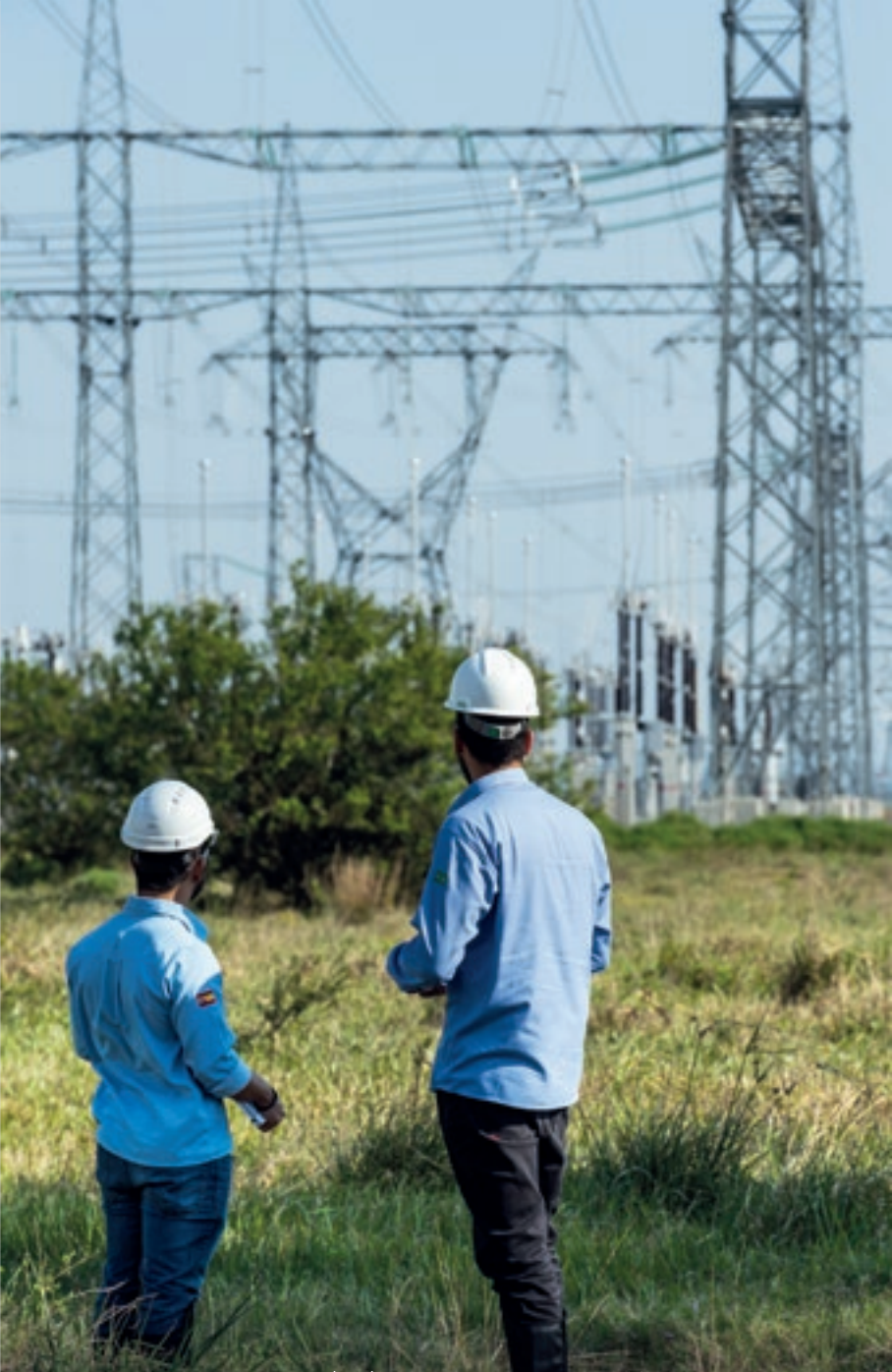
2401_05195. Translation: Alto International